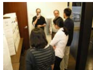
Students review each other's work at the poster session.