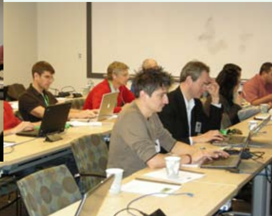
The participants at the SMC Transition workshop check email during a break in the action.

Carlo; Particle Learning; Theory; and Tracking. Non-exhaustively, the talks of these two days went as follows.