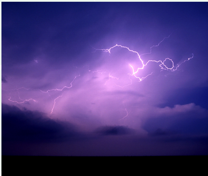
The uncertainty quantification program will focus on four major areas including methodology, climate, engineering/energy and the geosciences.

methodological thread to address this type of issue in the context of computer modeling. More specifically, this side of the program will investigate foundational issues, representation and propagation of uncertainties, data assimilation, inverse